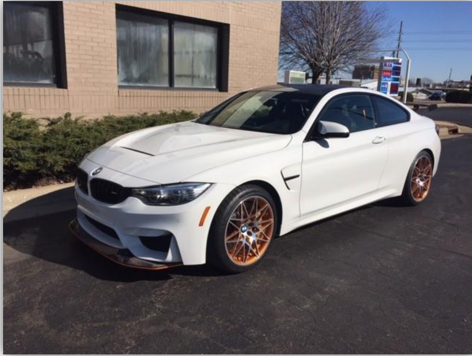
Cal's rare M4 GTS. See more on page 7.