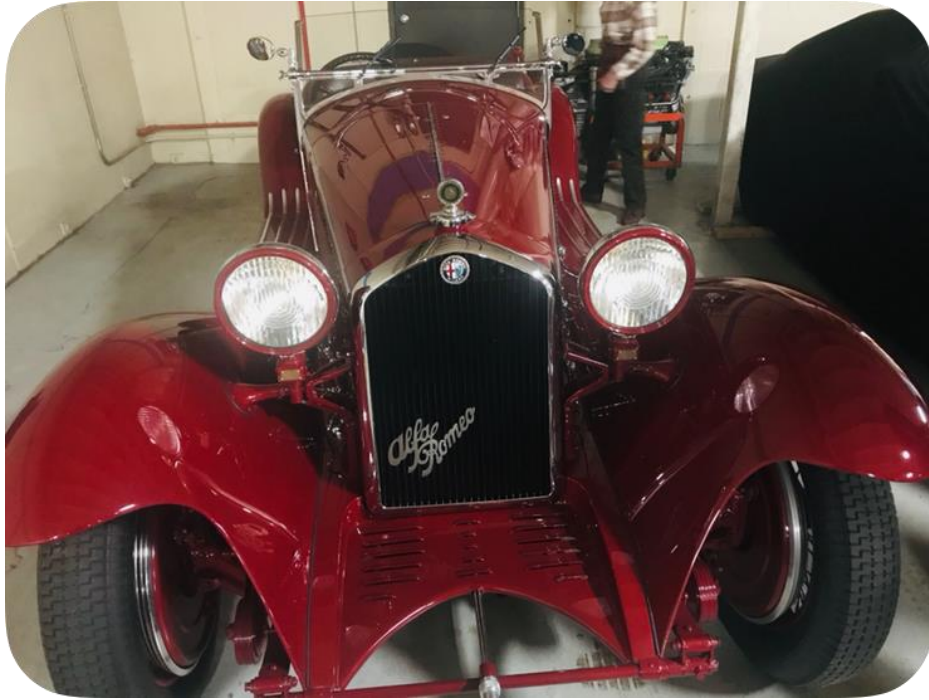
Badger Bimmers enjoy rare insider tour of Motion Products Inc. See more on page 5.