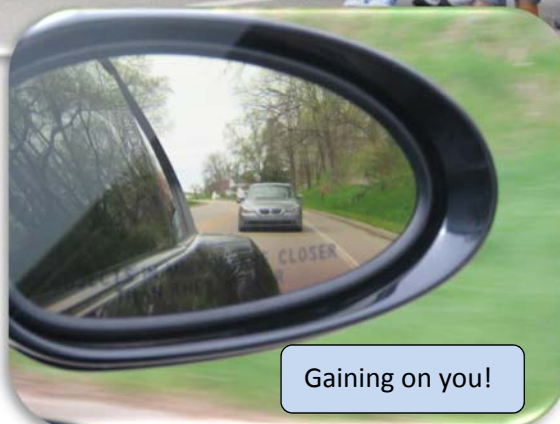
Gaining on you!