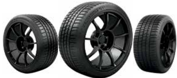
MICHELIN® Pilot® Sport A/S 3

324 West Cherry Street Milwaukee, Wisconsin 53212 414.273.1000