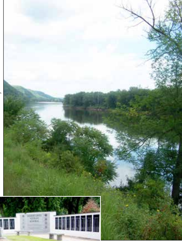
Wisconsin River overview from Route 60