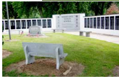
The Soldiers Grove Memorial

consin River, but then branch off northward on County Highway W , a winding road with farms and forests. We continue eastward on County S and F into the quaint village of Boaz, with its major road blocked! But no need to worry, since we'll take County E and Q directly into Richland Center, our next stopping point. Here we can catch another "Kwik Trip" to refuel our cars and ourselves, and there's ample parking surrounding the Community Building across Main and Seminary Streets.