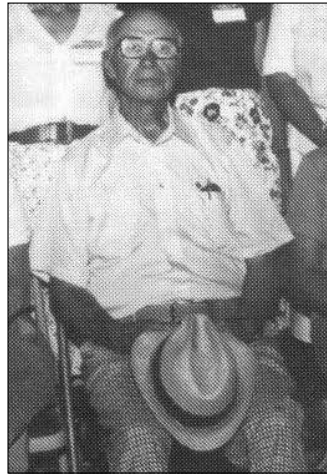
Carl Kiekhaefer (1906-83) in 1981

N ot a household name unless you're from Wisconsin — but who was Elmer Carl Kiekhaefer ? Was he the person who founded an aluminum foundry in Cedarburg; was he the person who founded Mercury Marine; how about the person who founded a boat-racing equipment juggernaut? Was he the person who owned a secret lake in Florida for testing race equipment known as Lake X, or perhaps the person who owned and ran a Chrysler-based team that won multiple NASCAR titles? The simple answer is Yes!