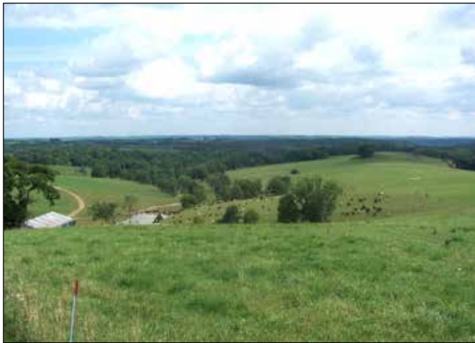
View from Husher's Wayside Park