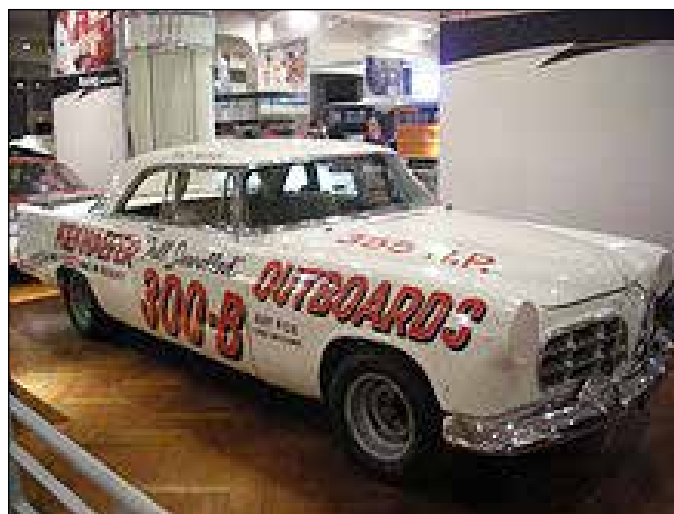
Baker's 1956 car

Herb Thomas of Hudson fame as a driver. NASCAR was astounded; they had never seen a team this well prepared dominate the series. There were rumors of rules violations although no action was even brought against Carl. Kiekhaefer walked away from automobile racing and jumped into water-based motorsports founding what would become the go-to place for boat racing equipment. bj