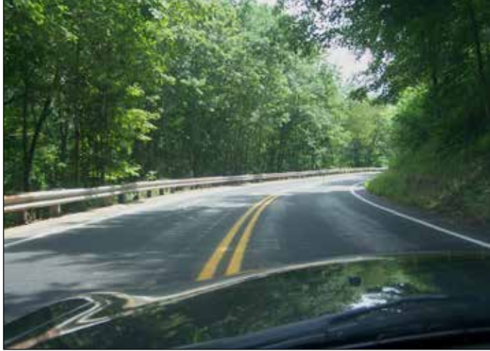
The Wildcat Mountain descent