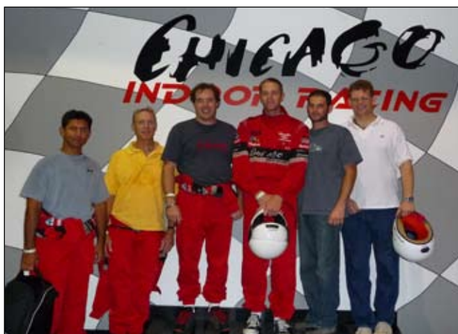
The Badger Bimmers 2008 Car Club Challenge Team