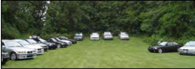
Badger Bimmer Biovac

even a few places to park in the shade. If you enter at the main gate (old gate 2) make a left turn once you get in and proceed around the track. As you go around the track you will go up a hill. At the top of this hill turn into the field on your right. If you park in this field you can get to the track by either the tunnel just north of the media center or the pedestrian bridge just to the north of the family fun zone. If you go through the tunnel you will come out at about the middle of the paddock. If you go over the pedestrian bridge you come out in the