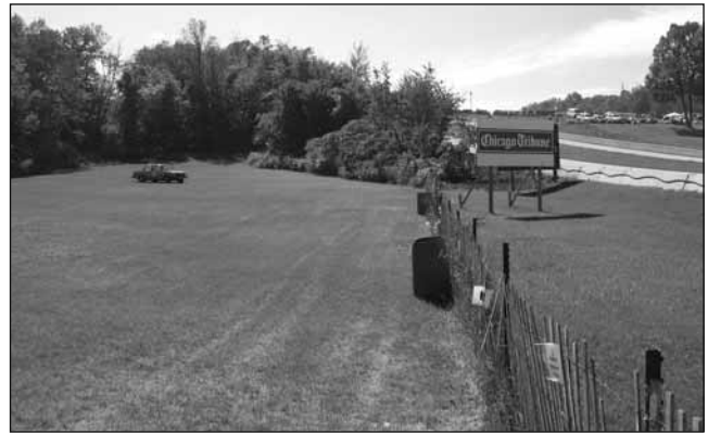
Looking south, up the hill from Turn 14.